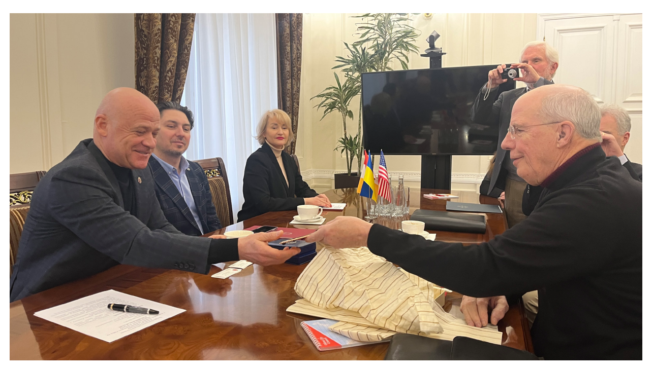
AFPC President Herman Pirchner, Jr. exchanges gifts with Odesa Mayor Gennadiy Trukhanov Mayor of Odesa following a ninety-minute meeting with the AFPC delegation.

survival in the current war. No one denied the existence of the problem or the need to eradicate Most interlocutors sought to persuade us it. that the problem of corruption is significantly less that in earlier years, that efforts to weed out corruption are serious and making progress, and that patriotic Ukrainians would not steal from American and European assistance in a war of national survival. The very pervasiveness of the protestations was an indication that Ukrainians are well aware of their national shortcomings in this respect and that their reputation for corruption is a serious problem abroad, especially in Germany where the concept of "Ukraine fatigue" originated.