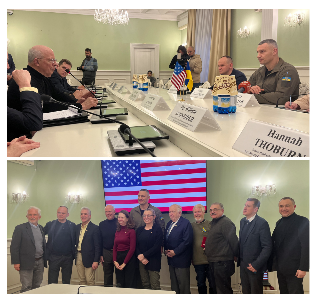
Kyiv Mayor Vitaliy Klitschko met with the delegation in Kyiv City Hall to discuss ongoing concerns regarding the expected Russian spring offensive.

identified three key priorities in new assistance from the United States: in air defense (such as Patriot missiles), for a new reserve army corp of mechanized brigades (equipped with Bradley Fighting Vehicles), and in more artillery of both 155mm and 105mm to include cluster munitions. Aware of the strong inhibitions in Washington about the provision of cluster munitions, they emphasized how helpful such ammunition could be in current combat circumstances and noted that the United States, Ukraine and Russia are