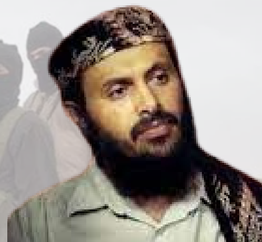
Qasim al Raymi emir (leader) of AQAP

There have been 17 total incidents since January of 2022